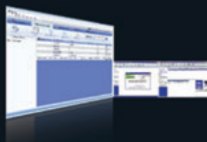
All In One Access Control Software

CM i 660 is a standalone fingerprint time attendance and access control system. Color monitors TFT LCD Display at 65,000 colors. Icon menu is easy to use. T9 input function to manage user information in the device. Support 3,000 fingerprints and record capacity at 100,000 records. Identify fingerprint within 1 second. Crystal optical sensor is the last technology which durable and stable. It supports USB port.